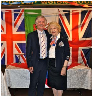
British and Welsh Flags