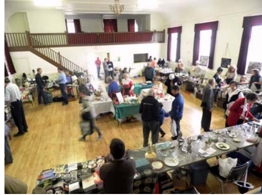
A lull in the action!

Our Annual Spring Sale on April 16 th generated net revenue of about $3000 for our Building Fund. Our home-made preserves and baked goods were again very much in demand and together with the Silent Auction of donated items accounted for about half the proceeds. Visitors enjoyed the teas in the Red Dragon – as did the volunteers manning the stalls! After the first flood of buyers in the first hour and a half, we had a lull at lunch time before the afternoon ‘tide’.