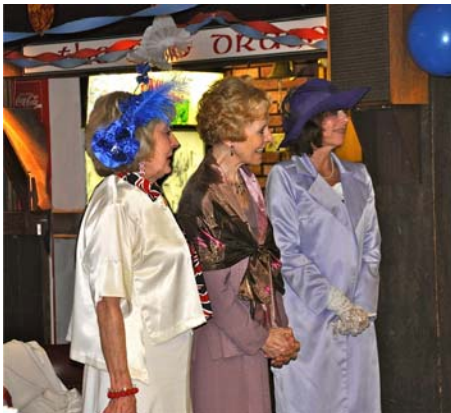
The Three Runners Up