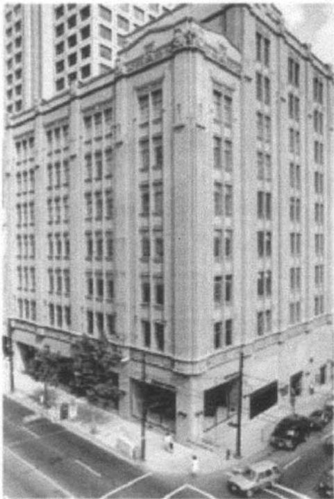
THE SPENCER BUILDING