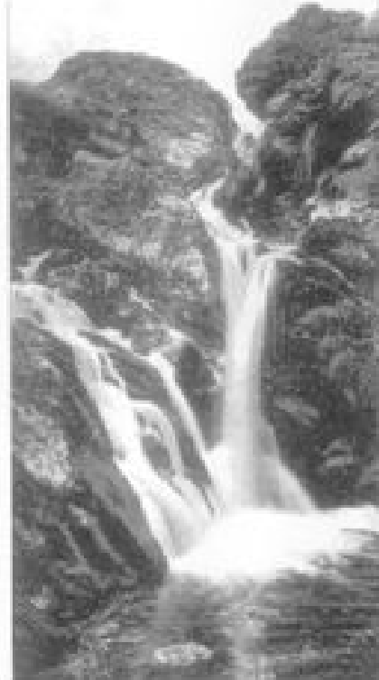
Dyffryn Peirioŷ Valley (a fu/ysteryear)

CAMBRIAN HALL, 215 East 17 th Ave, Vancouver B.C. V5V 1A6