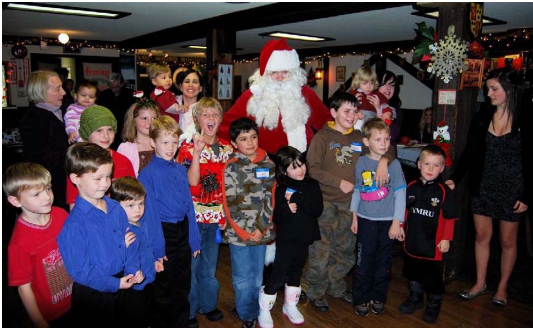
A Popular Visitor at the Children's Christmas Party

Society Newsletter - Pylchgrawn y Gymdeithas