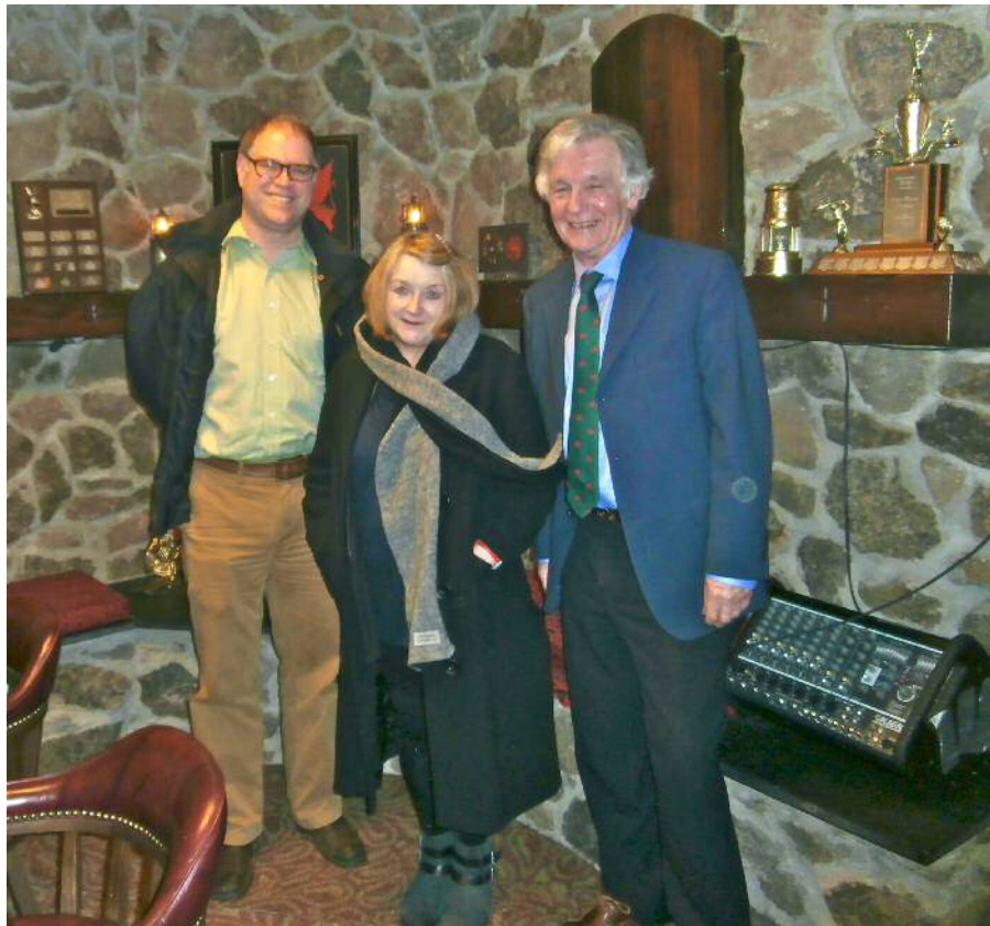
Menna Elfyn at the Cambrian Hall

Society Newsletter - Cylchgrawn y Gymdeithas