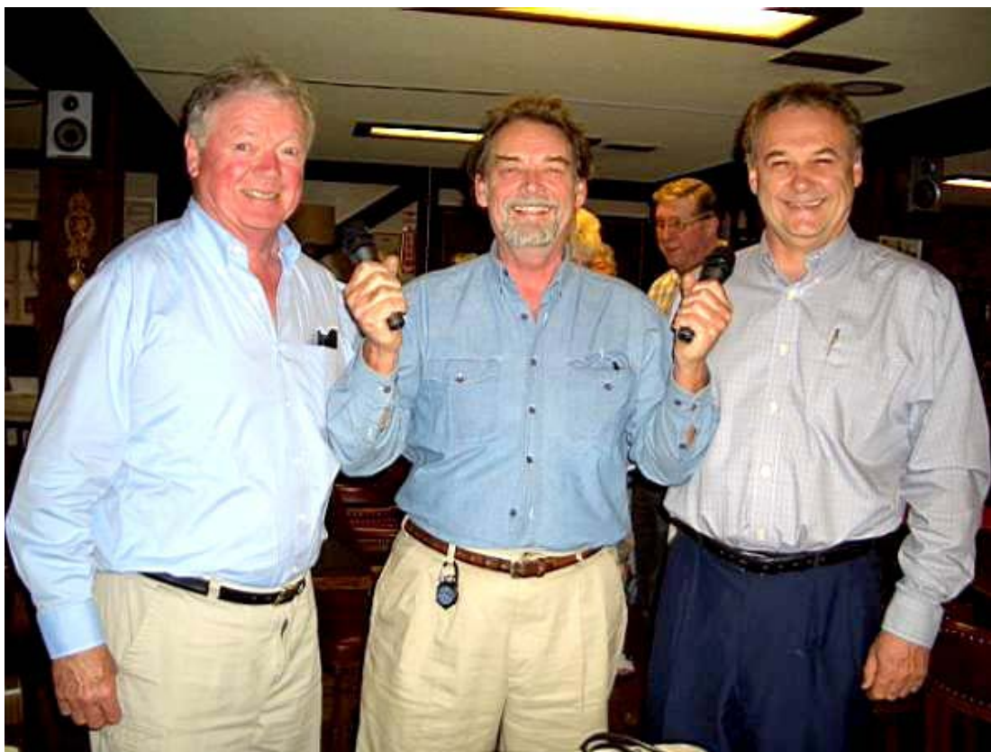
Patagonia Evening Presenters

Society Newsletter - Fylchgrawn y Gymdeithas