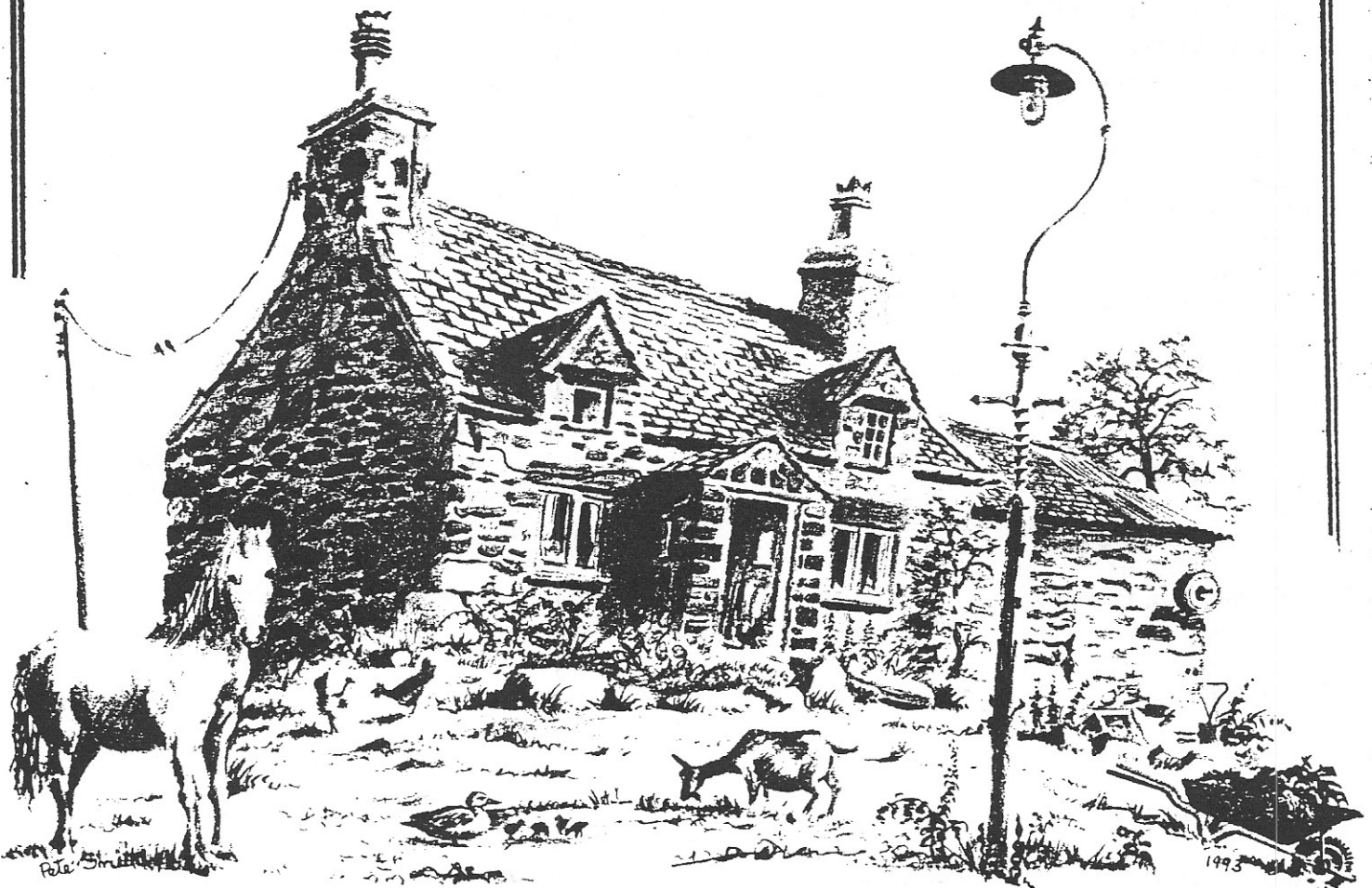
Parc Cottage, Tregarth

Welsh Society Newsletter — Cylchgrawn Cymraeg