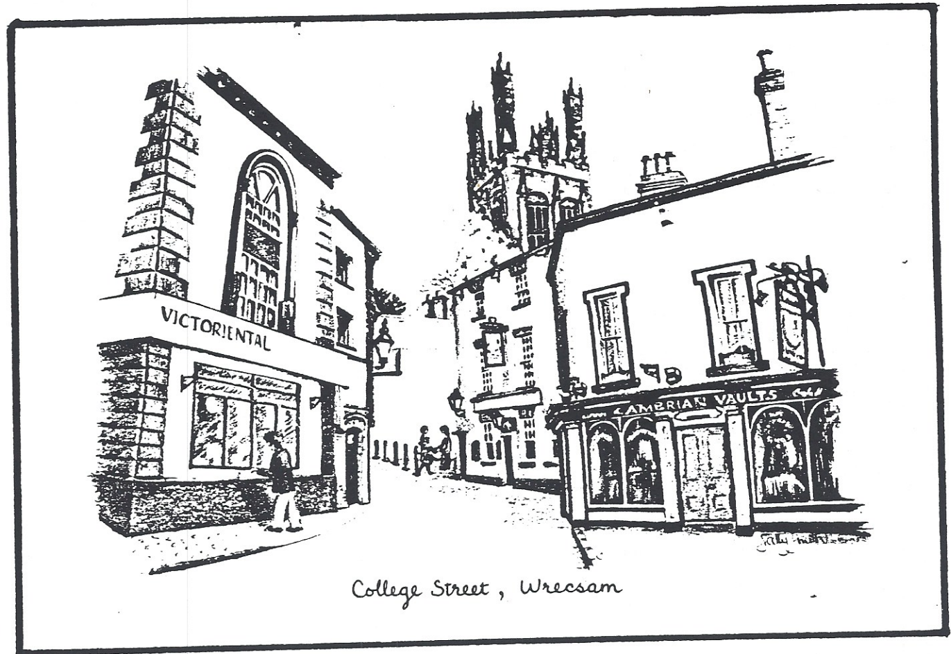
College Street, Wrexham

Welsh Society Newsletter - Cylchgrawn Cymraeg