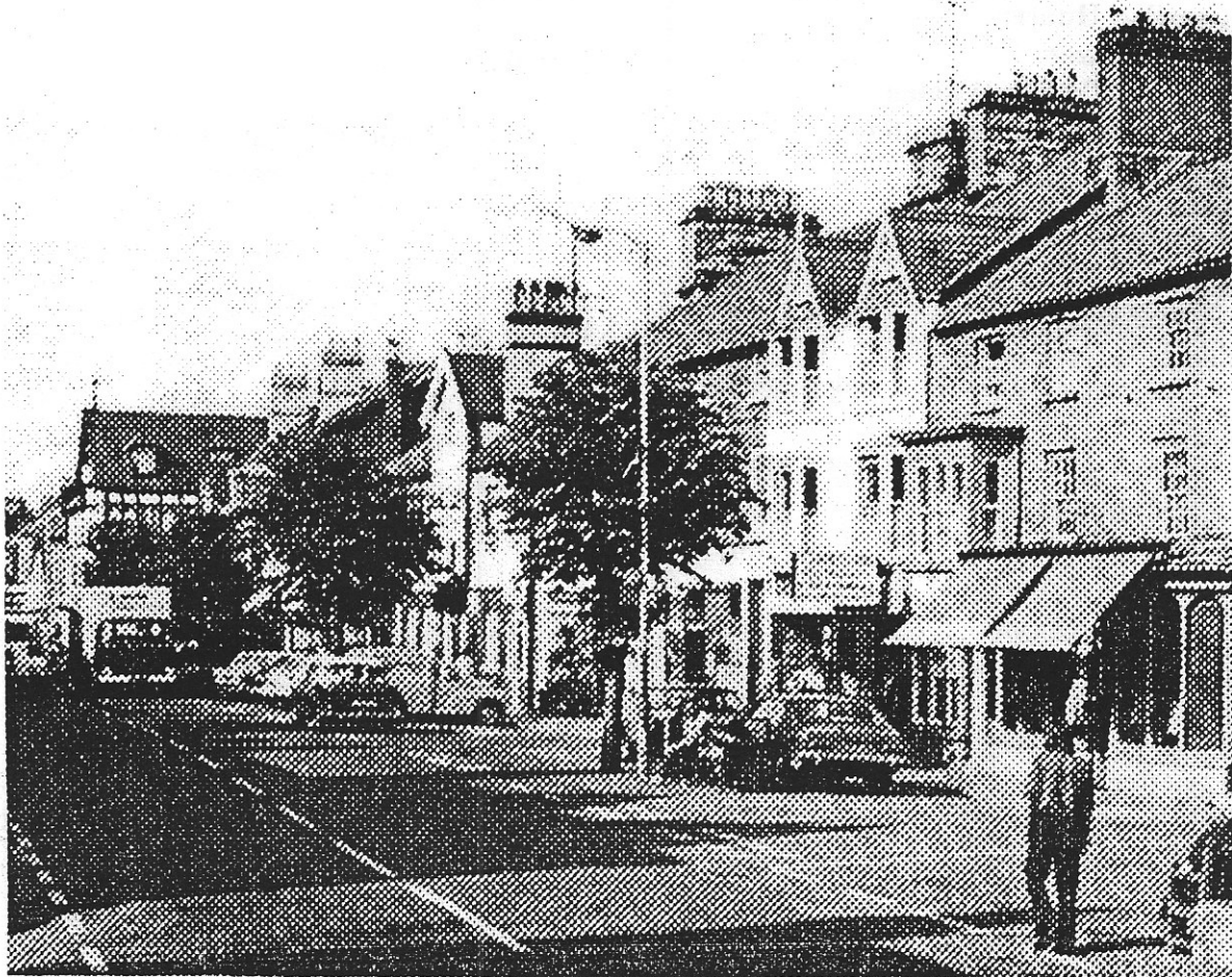
Above: The picturesque town of Bala, in the heart of Wales,

Welsh Society Newsletter — Cylchgrawn Cymraeg