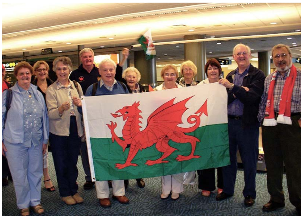
Greeting the Llanelli Choir's Arrival

Society Newsletter - Pylchgrawn y Gymdeithas