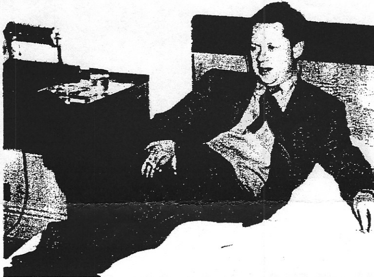
Thomas in his room at the Hotel Vancouver during his 1950 visit

A celebration of Dylan's life and work and commemoration of his death in New York City in 1953. A recounting of his visits to Vancouver and Montreal and his influence on Canadian letters. A program featuring lively speakers, films, displays and performances.