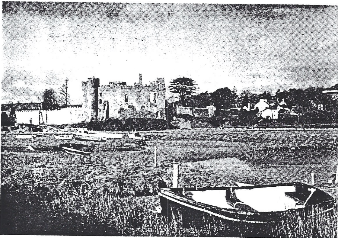
Laugharne, Dyfed, a view that inspired Dyland Thomas's "Under Milk Wood".