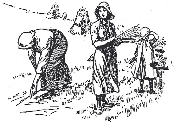
Go gleanng in rich September.

But none with the purple, gold, and red That dyes the flowers of September! The gorgeous flowers of September! And the sun looks through A clearer blue, And the moon at night Sheds a clearer light On the beautiful flowers of September!