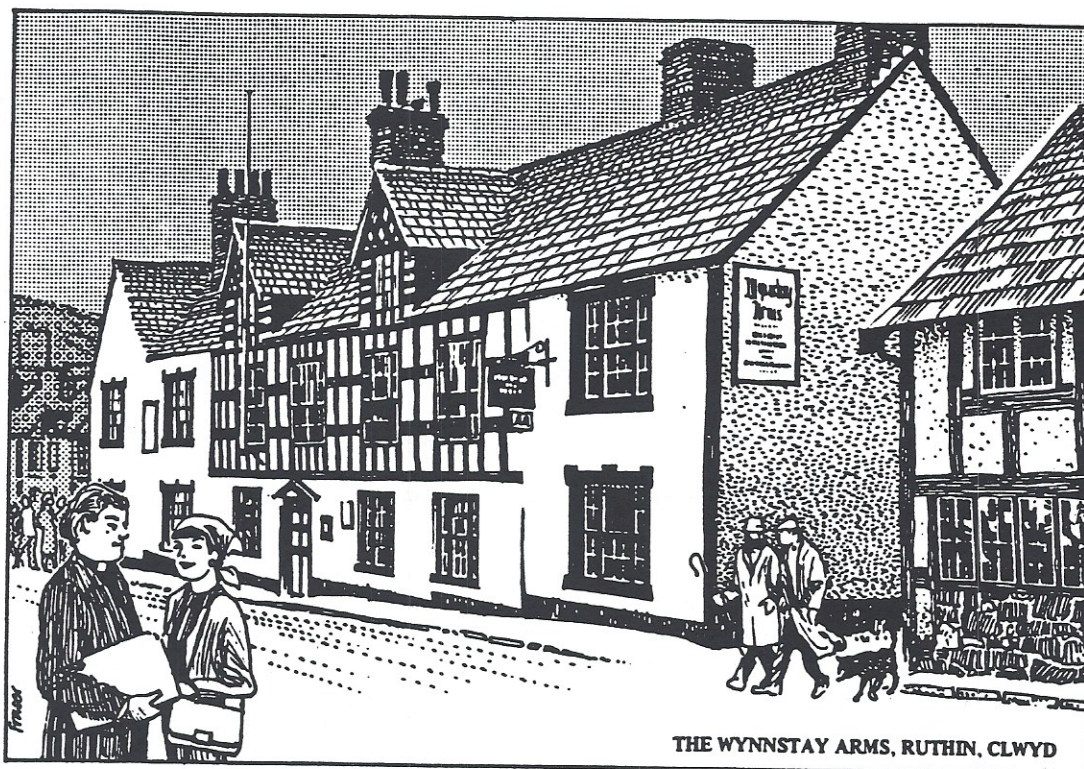
THE WYNNSTAY ARMS, RUTHIN, CLWYD

Welsh Society Newsletter — Cylchgrawn Cymraeg