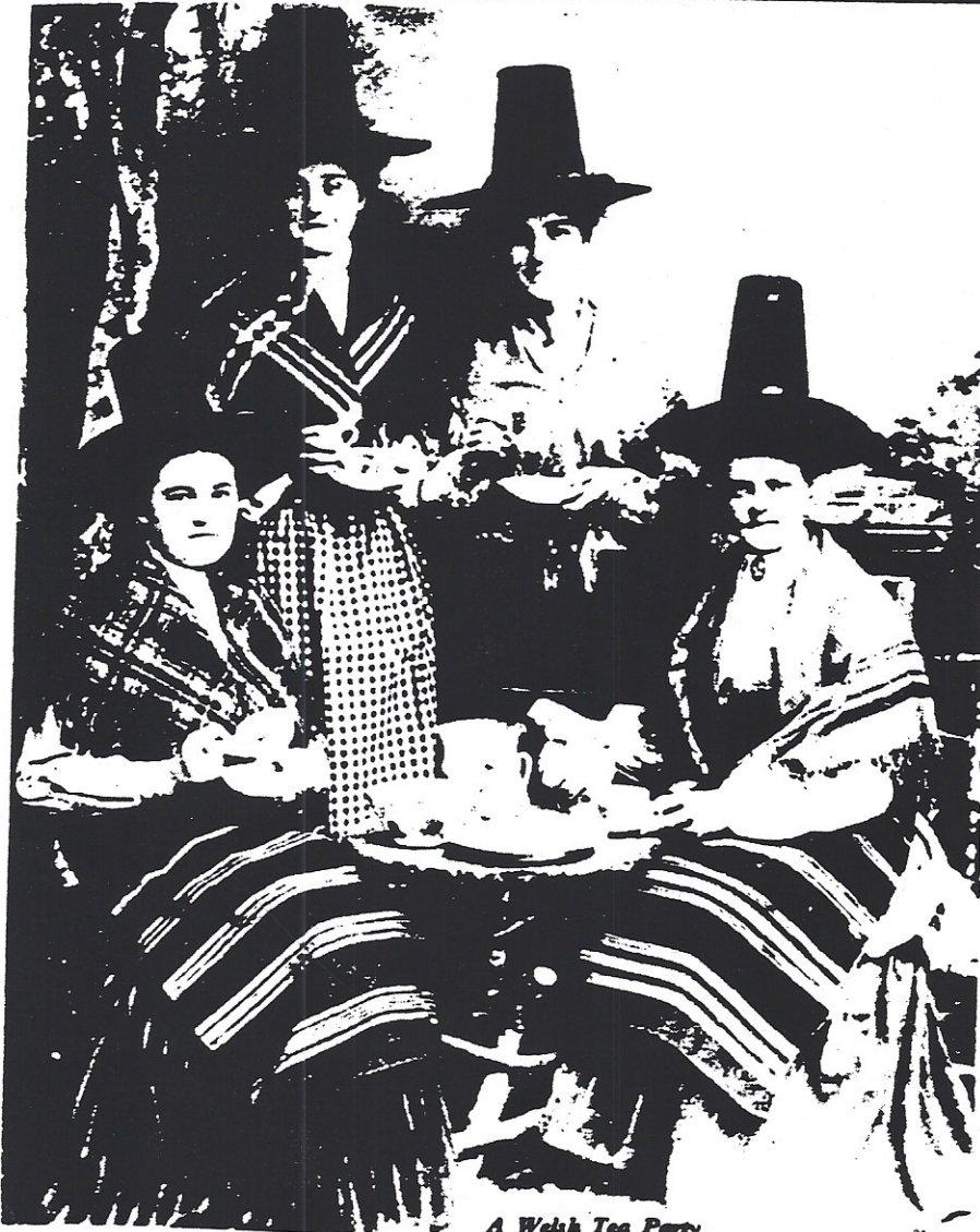
A Welsh Tea Party

Welsh Society Newsletter — Cylchgrawn Cymraeg