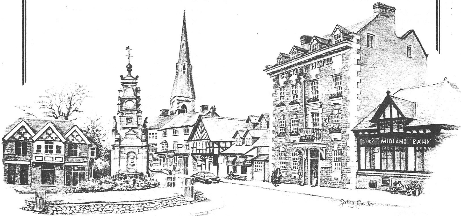
The Square, Rhuthun

Welsh Society Newsletter — Cylchgrawn Cymraeg