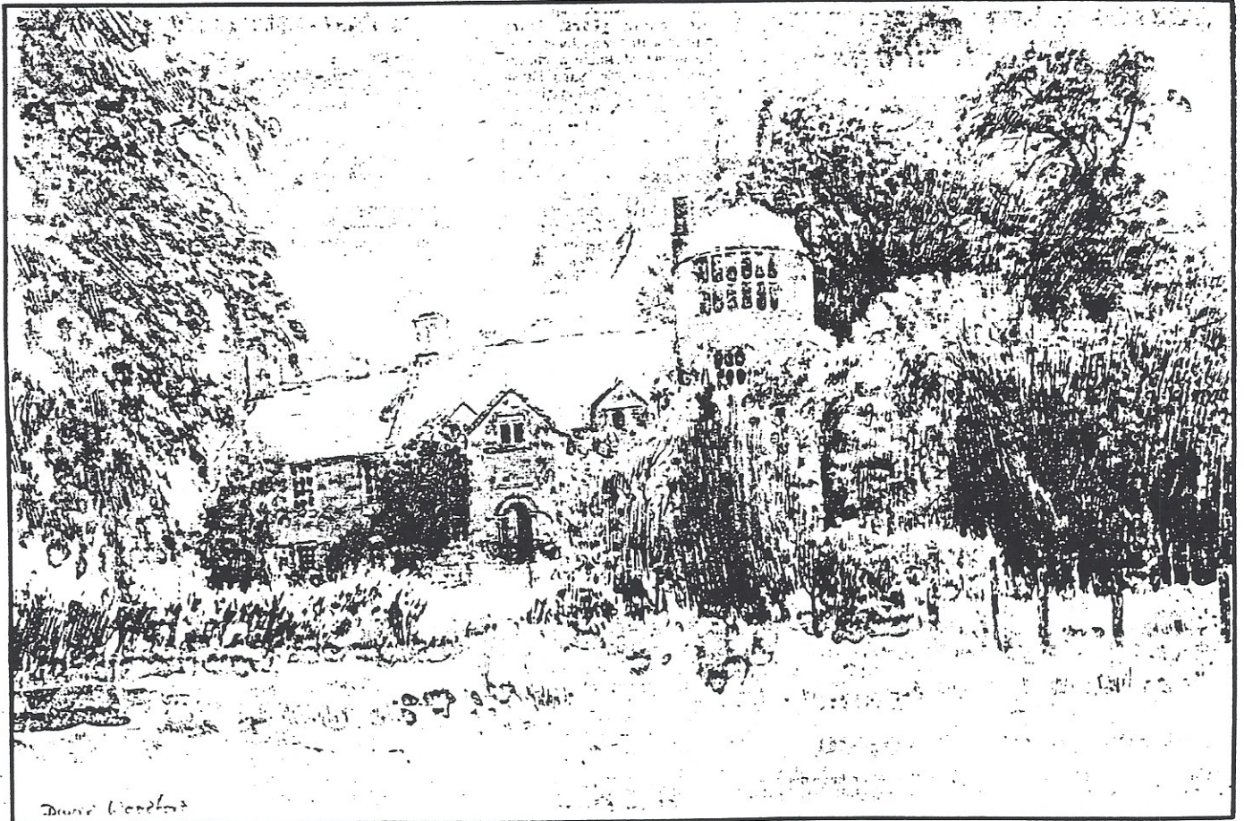
The Palace at Aber

Welsh Society Newsletter - Cylchgrawn Cymraeg