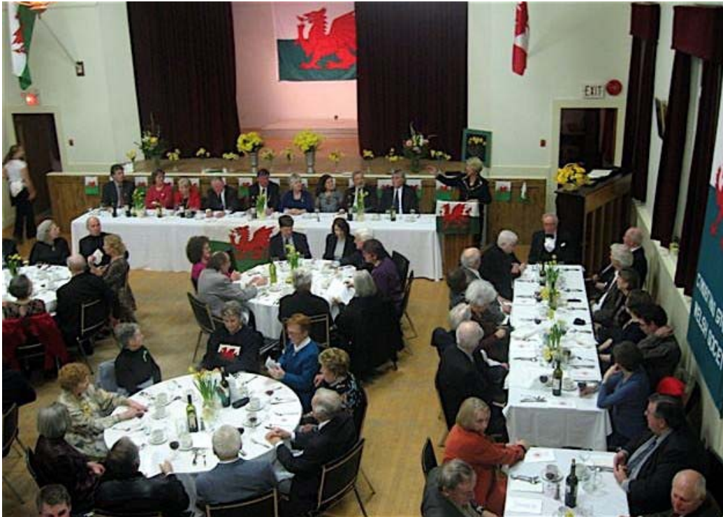
St. David's Day Banquet

Society Newsletter - Pylchgrawn y Gymdeithas