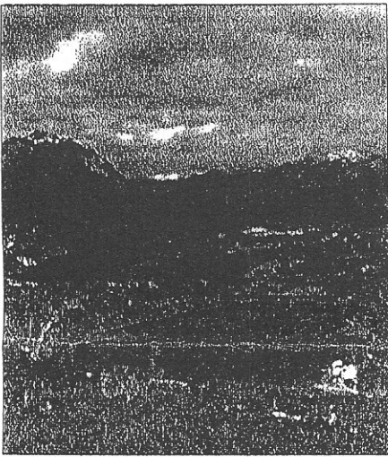
Patagonia - different hillsides, same welcome!

Links between Patagonia and Wales date from 135 years ago when Welsh settlers went there and, in the province of Chubut, Welsh traditions and culture still survive.