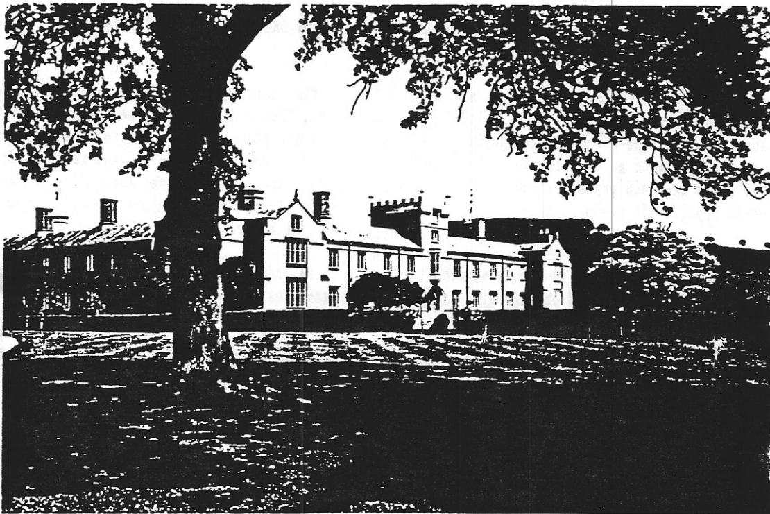
LAMPETER ST. DAVIDS UNIVERSITY

Welsh Society Newsletter — Cylchgrawn Cymraeg