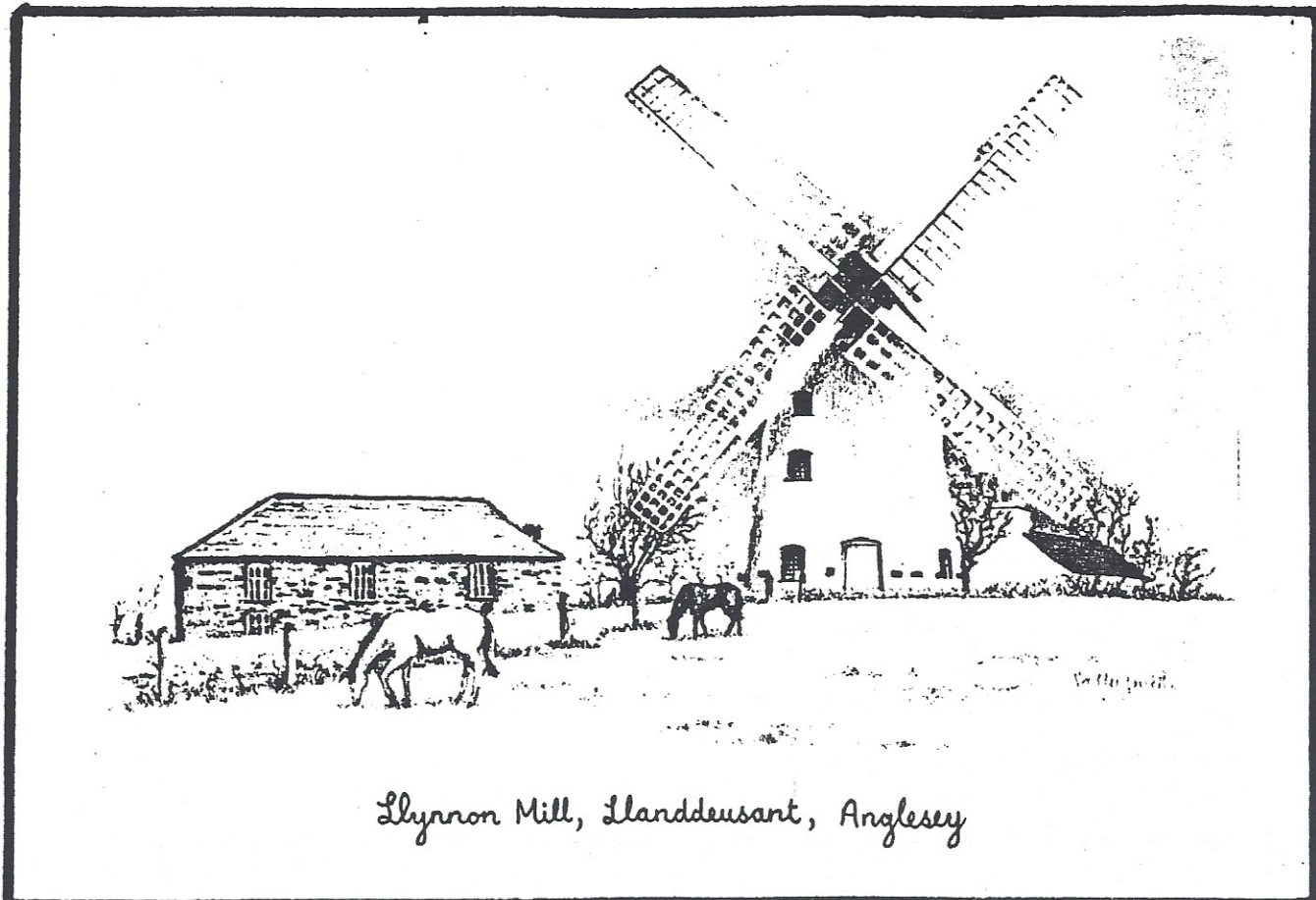
Llynnon Mill, Llanddeusant, Anglesey

Welsh Society Newsletter - Cylchgrawn Cymraeg