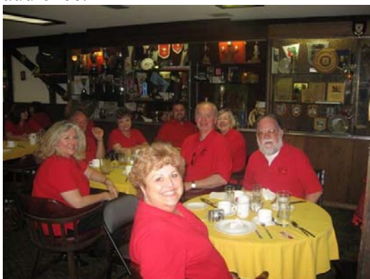
The Choir in the Red Dragon

The Welsh Choir of Southern California (Côr Cymraeg De Califfornia) charmed the audience at St. James Anglican Church, Cordova Street, on the evening of June 28 th with a mix of secular, sacred modern and traditional music. The Choir's rendition of traditional songs and hymns in the Welsh language proved particularly popular with those members of the Welsh community in the audience.