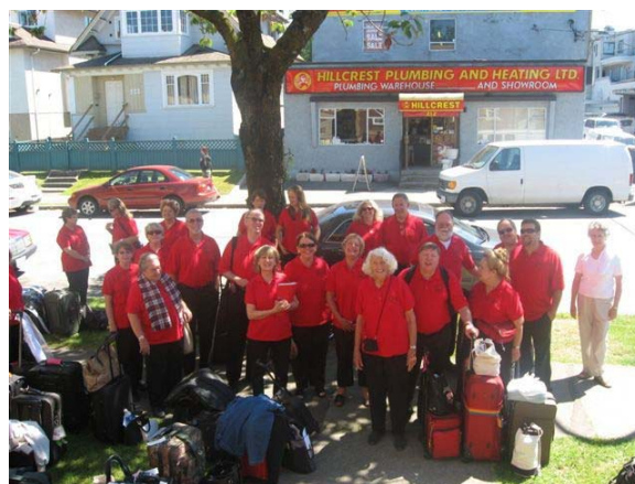
California leaving on a summer's day!