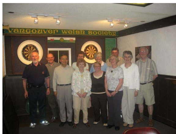
Cambrian Society Hosts