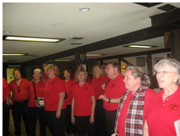
Singing for their lunch!