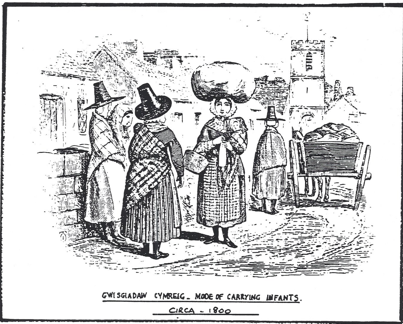
GWISGLADAW CYMREIG - MODE OF CARRYING INFANTS.

Welsh Society Newsletter - Cylchgrawn Cymraeg